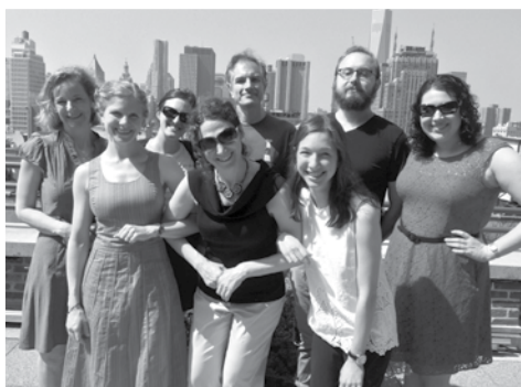
Team Scope on the Scholastic roof deck

We're starting the year off with a fantastic issue. Our objective? To engage your students with riveting content while delivering the skill-building activities they need to succeed in your classroom (and beyond).